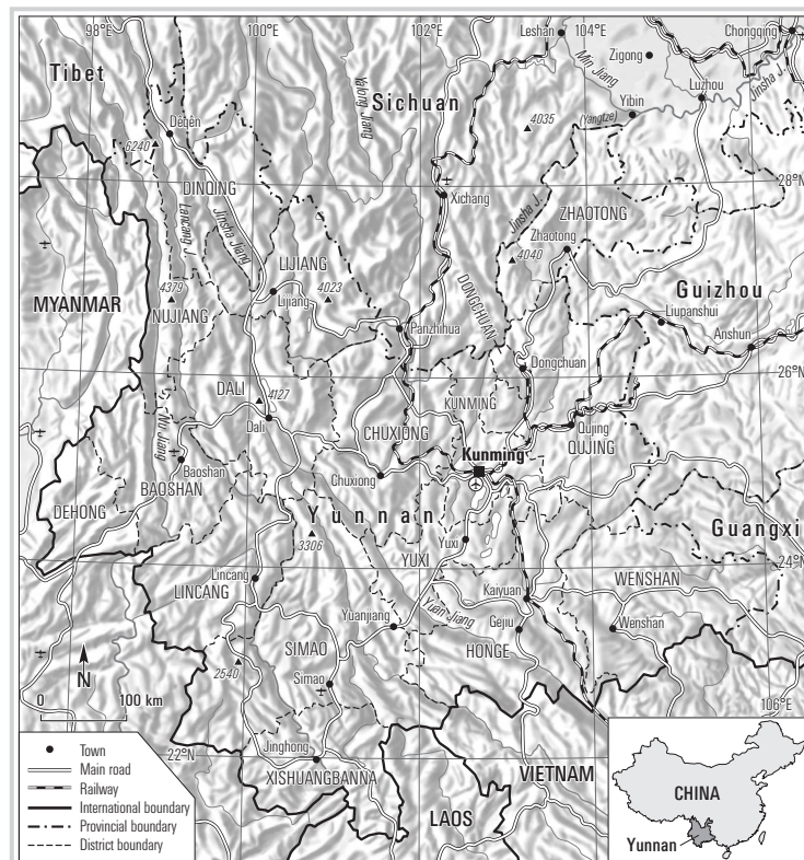
FIGURE 1 Map of Yunnan Province. (Map by Andreas Brodbeck)

The province of Yunnan is situated in southwest China. It covers an area of 394,000 km 2 . It neighbors Guizhou and Guangxi provinces in the east, Sichuan province in the north, and Tibet in the northwest, and has state borders with Myanmar in the west and southwest, as well as Laos and Vietnam in the south (Figure 1). Yunnan is a transition area between south China and the eastern Himalayas. In Yunnan, 3 major Asian climate zones come together: the tropical monsoon zone of South Asia, the subtropical monsoon zone of East Asia, and the Qinghai-Tibetan Plateau zone. This accounts for Yun-